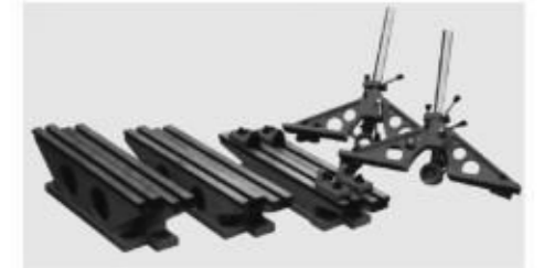
cylinder clamping device