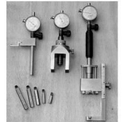
measuring device & boring cutter