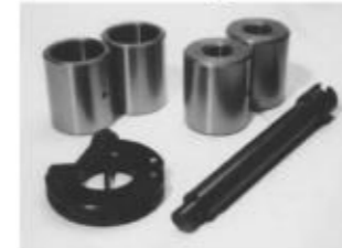
boring sleeve & extending shaft(290mm)