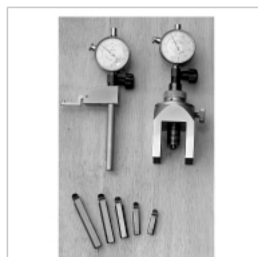
measuring device & boring cutters