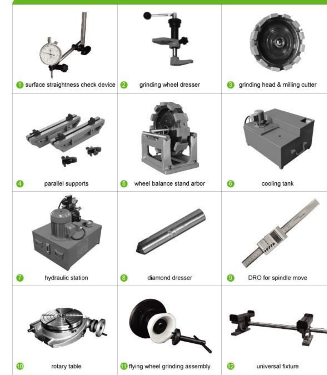
Table of Standard and Optional Accessories