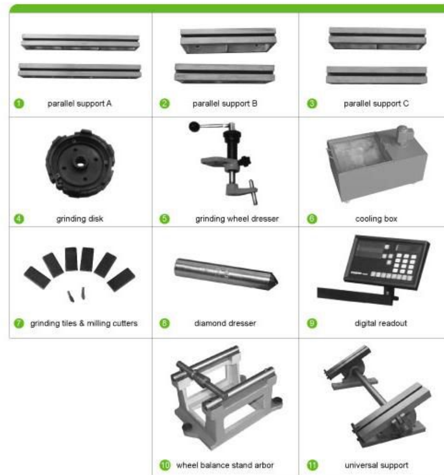
Table of Standard and Optional Accessories